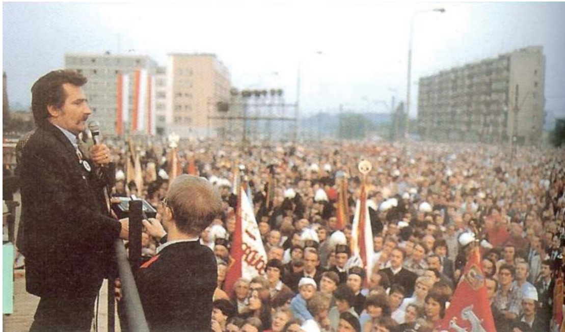
A photograph of Lech Walesa, the 'Solidarity' leader, speaking at Gdansk in 1980.

8 Look at the photograph, and then answer the questions which follow.