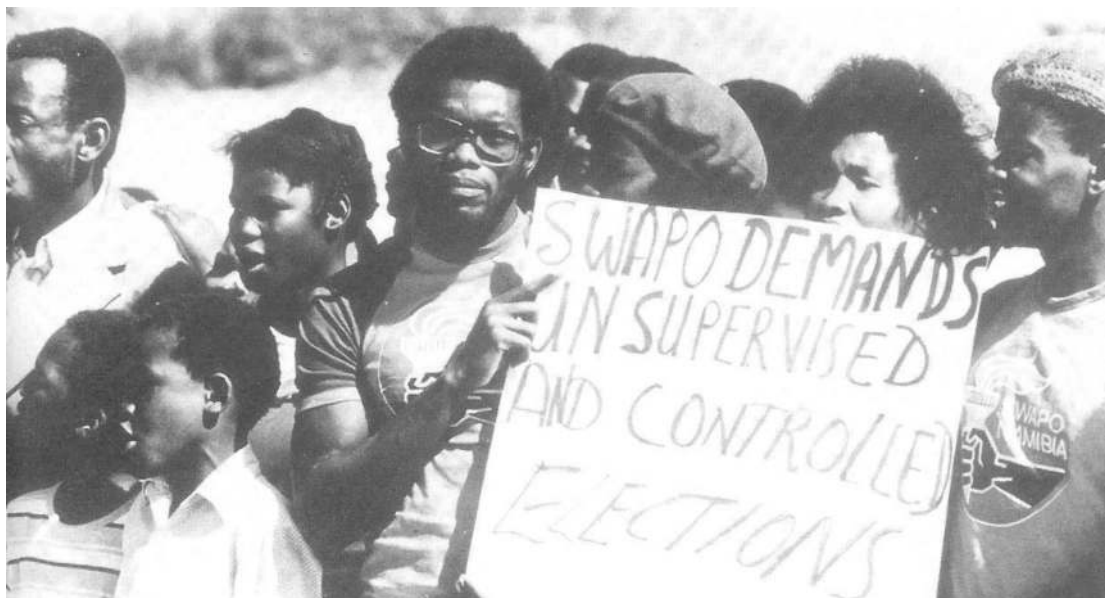
A photograph of a SWAPO protest in 1978.

19 Look at the photograph, and then answer the questions which follow.