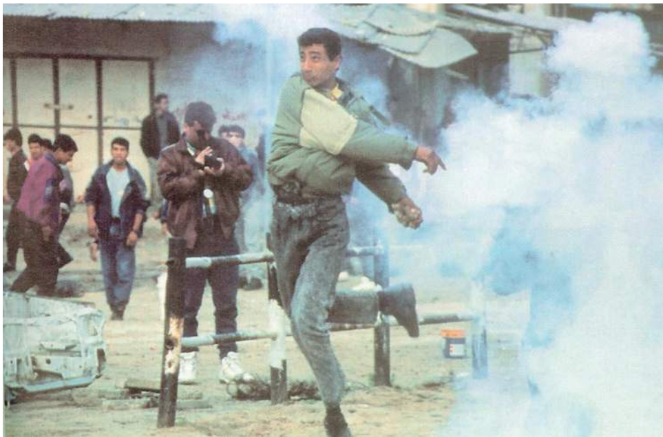
A photograph of a Palestinian protester in Hebron.

21 Look at the photograph, and then answer the questions which follow.