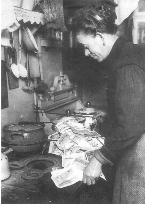
A photograph taken in 1923 showing a German housewife using paper money to light her kitchen stove.